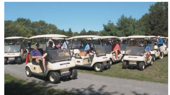
Golfers hit the course at the shot gun startup.