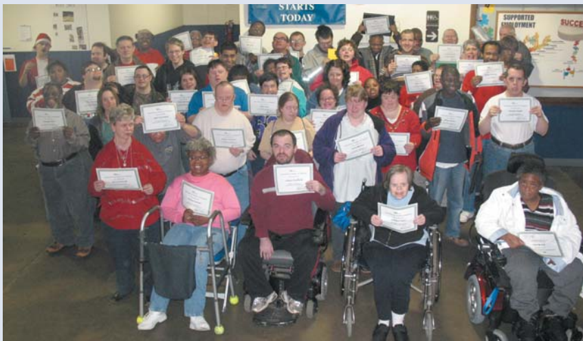
KSI recognized 135 employees with perfect attendance in November. Some individuals do not appear in this photo as they were at other work locations.