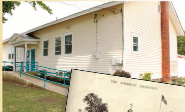
The present Kamp Lenape's main building shows the surviving dimensions and portico that were hallmarks of the DuPont schools' design model.

There was a movement for progressive school reform nationwide from the 1890s to the 1920s to help bridge the educational quality deficiencies experienced by underserved communities. DuPont company president Pierre S. du Pont took these inequities to heart, seeing how behind Delaware was in fixing its educational system, which remained racially segregated well into the 1960s. In 1917, Mr. du Pont joined the state board of education and enlisted the Rockefeller Foundation to do a comprehensive survey of schools and education throughout Delaware. Among many of the issues uncovered was the heinous state of schools serving African American students.