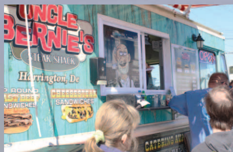
Kiss My Axe (left) and Uncle Bernie's Steak Shack were on hand during the car show to offer participants even more than a look at the best show cars around.