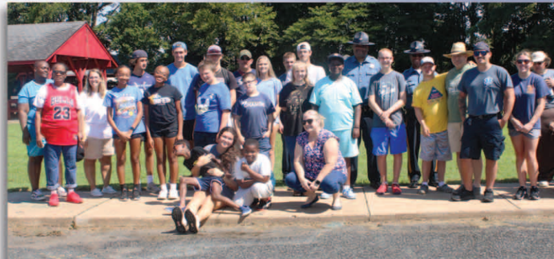
Campers and KSI participants had the chance to enjoy the summer together.