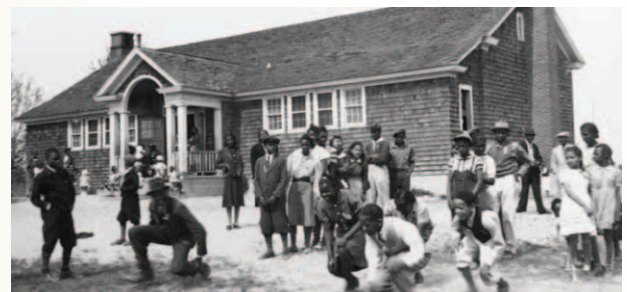
With plenty of land around them to run and play, the DuPont schools like this provided safe places to learn and grow.

This investment in schools serving communities of color helped boost student attendance in those communities as well as citizens' personal commitment to preserving these schools for the future. African American students in Kent County attended Union School up until the 1960s. In the 1970s, United Cerebral Palsy of Delaware purchased the property to make it into Camp Lenape for children with and without disabilities. And KSI will carry on this nearly 100 year-old tradition of serving the community's families with support for quality lives.