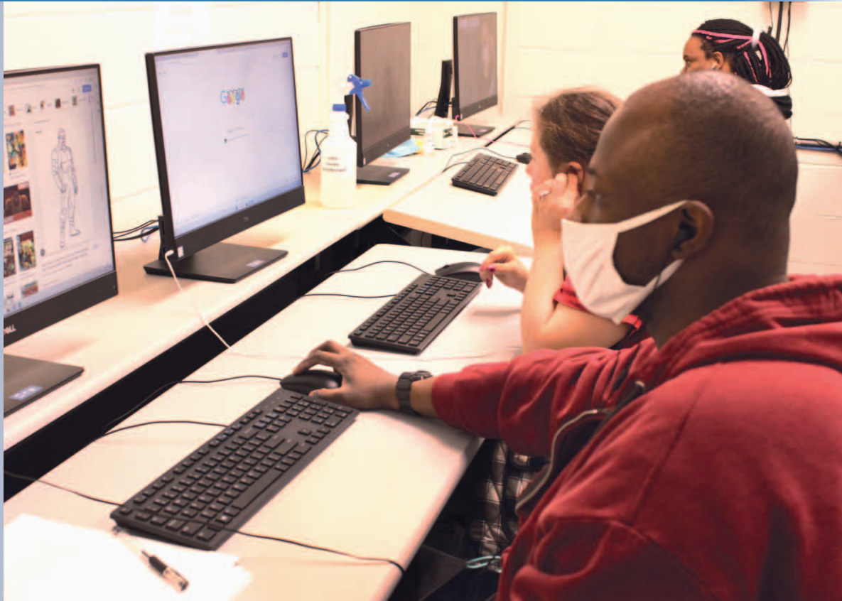
A $20,000 grant will help KSI obtain new training tools and purchase the technology to use them.