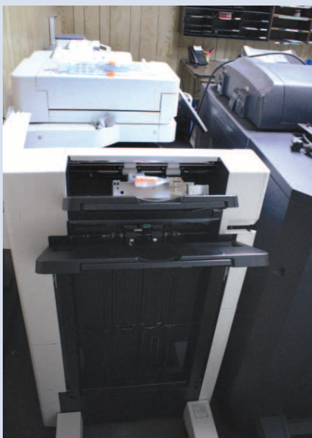
A new copier (at left) funded by a M&T grant gets readied for use by KSI's staff.

In June, KSI received a $2,500 grant to support the purchase of two new printers/copiers/scanners for creating materials serving multiple programs. KSI staff have soldiered on with one color copier located in the northern corner of the Milford Skill Development Center. The M&T funds will help with the purchase of new units that will allow one machine to be used for programming materials in Pre-Vocational Training in the north of the building and another unit to be located in the southern wing of the center that can be easier accessed for materials needed to support the Life Enrichment Program.