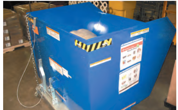
One of the new recycling hoppers funded by DNREC.

DNREC's goal is increasing the amount of municipal and commercial waste material diverted from landfills from 37.4% to between 50-72% by January 1, 2015. That target increases again to 60-85% in January 2020. Eligible applicants included those engaged in the business of collecting, transporting and processing recyclable waste, as well as those who contracted for those services. Costs covered by the funding