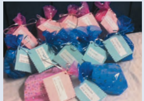
One of Aktion Club's newest initiatives is the Holiday Baby project, featuring these beautiful gift packets for newborns at Bayhealth Hospital.