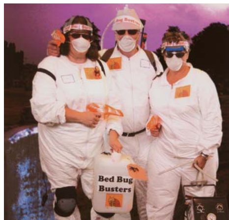
The Bed Bug Busters cleaned up as one of the top winners of the costume contest.