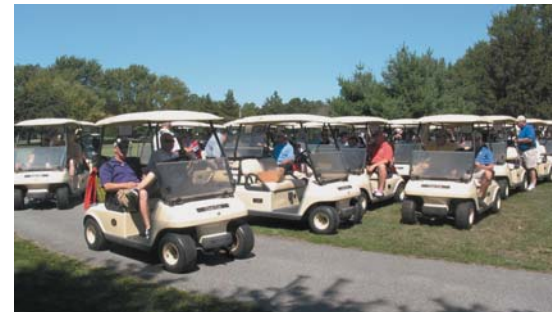
Golfers hit the course at the shot gun startup.