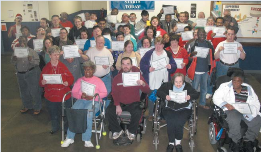
KSI recognized 135 employees with perfect attendance in November. Some individuals do not appear in this photo as they were at other work locations.